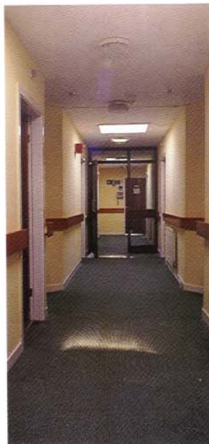
Right - Wide corridors with handrails.