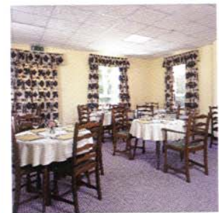
Below - Part of the large dining room.