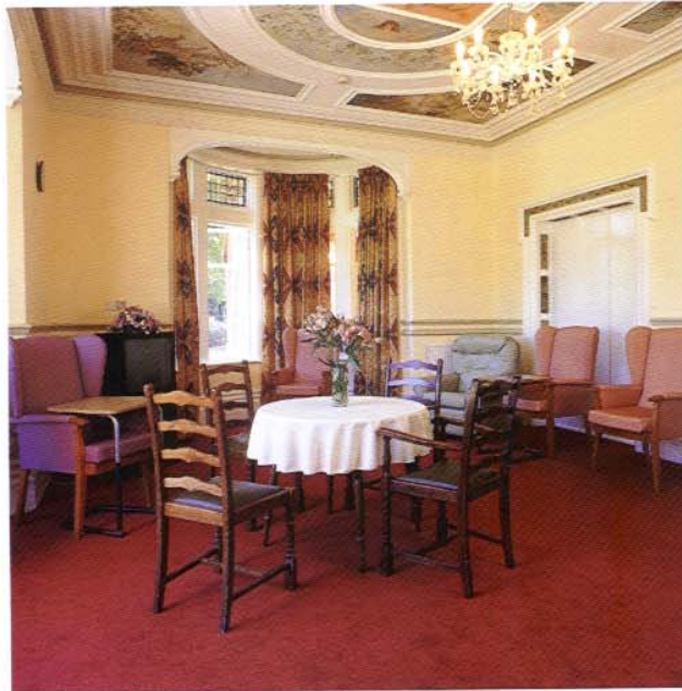
Left - One of four lounges which includes a sun lounge.

This stately home, part of which is a listed historical building, has modern purpose built extensions and includes 34 single rooms and 3 double rooms. Some of the rooms have en-suite facilities. We have a range of baths - hydraulic, electronically operated and some adapted with chair hoists. Since acquisition, the owner has completely refurbished Alexandra. It is light, bright, modern and airy