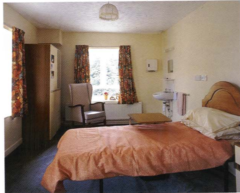
Above - A typical bedroom.