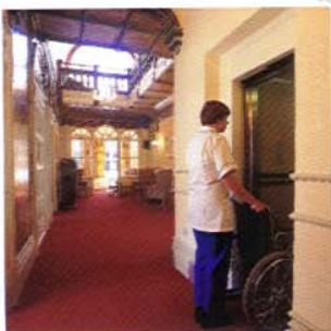
Above - Six person passenger lift.